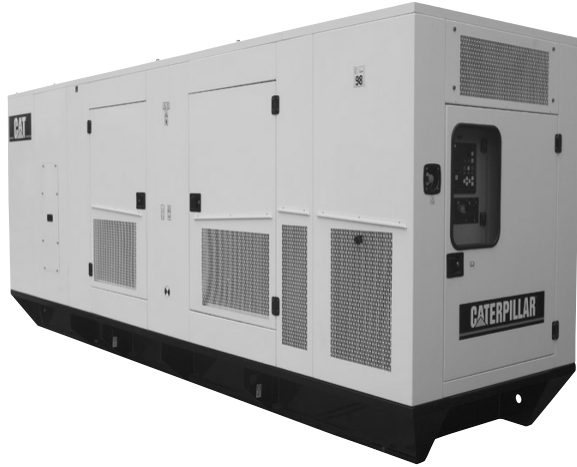
Picture shown may not reflect actual package.